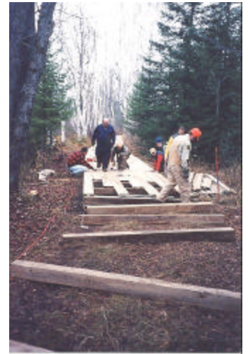
The TBTA will need volunteers to complete a bridge project this spring at Norway Ridge Trail.

The Thunder Bay Trails Association has received a $2,500 grant from the Community Foundation for Northeast Michigan. The grant along with a donation of $500.00 from Lafarge Corp., $300.00 from Louisiana Pacific, and $1000.00 of TBTA membership funds will go to complete a decking project in a wet section of the Norway Ridge Trail. This will complete the much needed improvements that will allow year round use of the trail during the wet seasons of spring and fall. Members are needed to assist in the building of this bridge project scheduled for this spring. We will be certain to notify our members of the work project dates as we get closer to spring. This is the second grant the TBTA has received from both the Community Foundation for Northeast Michigan and Louisiana Pacific.